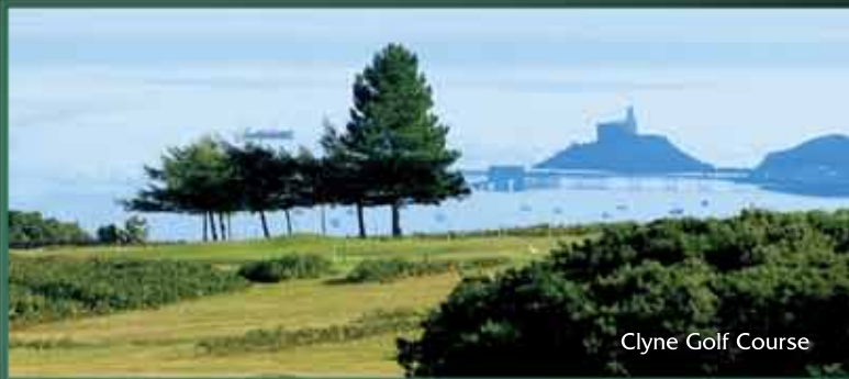
Clyne Golf Course