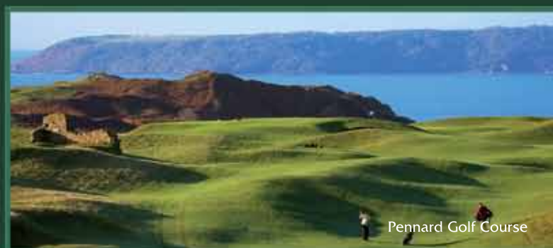
Pennard Golf Course