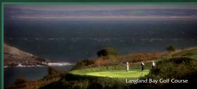
Langland Bay Golf Course