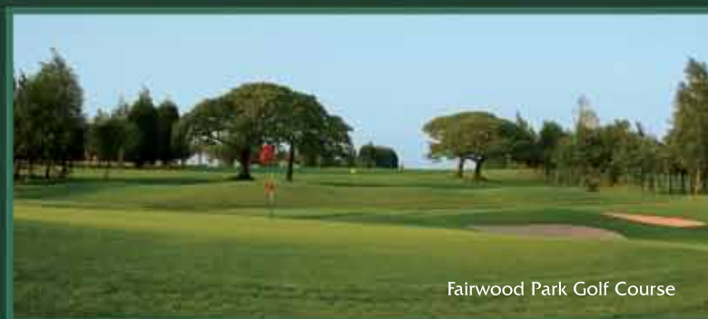
Fairwood Park Golf Course