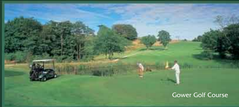
Gower Golf Course