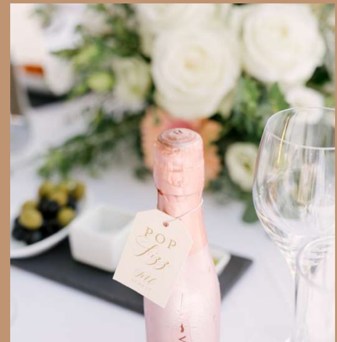
Table runners, chair covers, back drops, dance floors, candy carts, martini glasses, fresh flowers to name a few, work with us to make your wedding room show stopping.